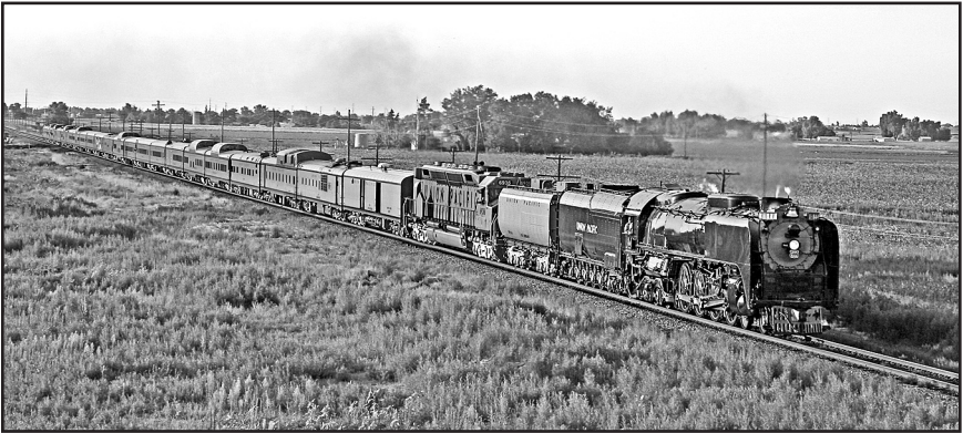
UP 844 leads the July 18, 2009, Cheyenne Frontier Days Train.