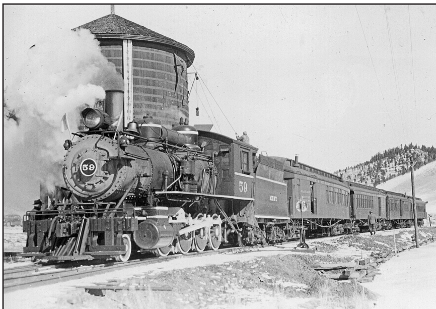
The Midland Terminal Railway Club special taking water at the Midland, Colorado, water tank.