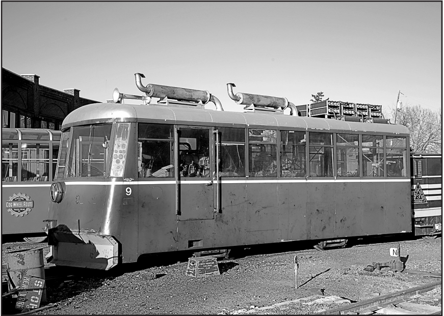
The Manitou & Pike's Peak Railway diesel motor #9 with coach #12 behind at the Colorado Railroad Museum roundhouse.