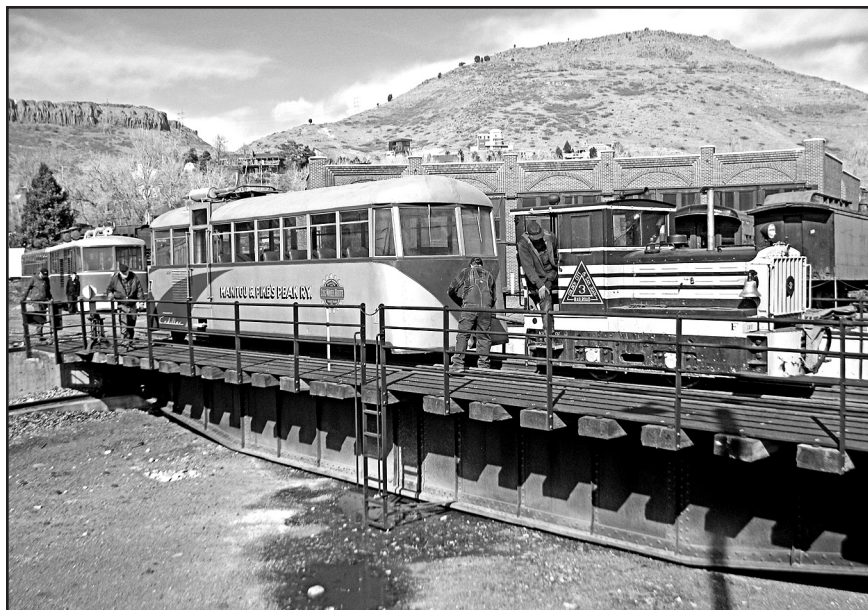
The Manitou & Pike's Peak Railway gasoline car #7 arrives and is pulled onto the Colorado Railroad Museum's turntable. Diesel motor #9 and coach #12 are in the background.