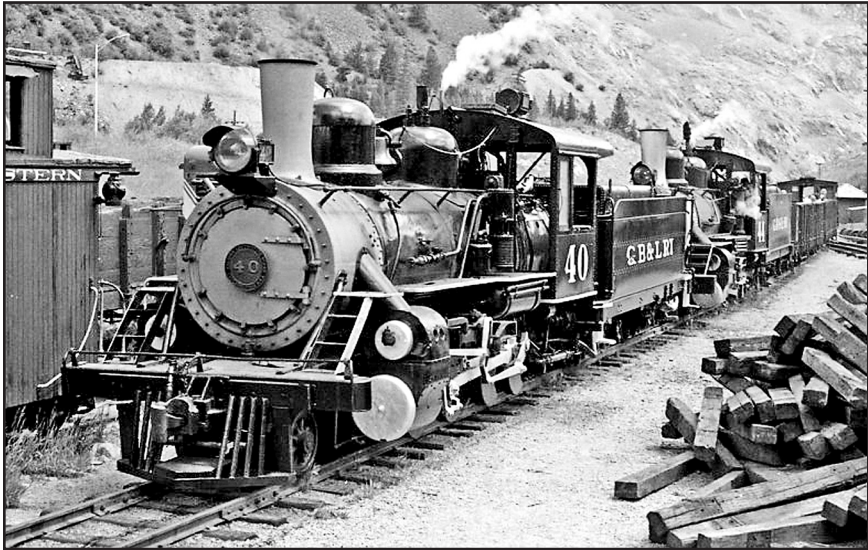
Georgetown Loop #40 and #44 in the Silver Plume yards.