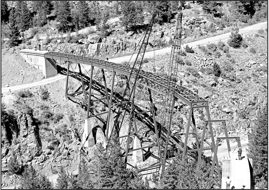
Setting the center span on the famous Devil's Gate Viaduct "high bridge." – Photo © Bill Robie.