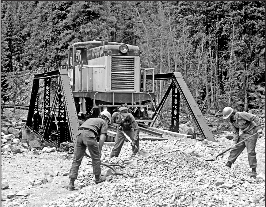
SeaBees do grading work at the Georgetown Loop Pin Truss bridge.