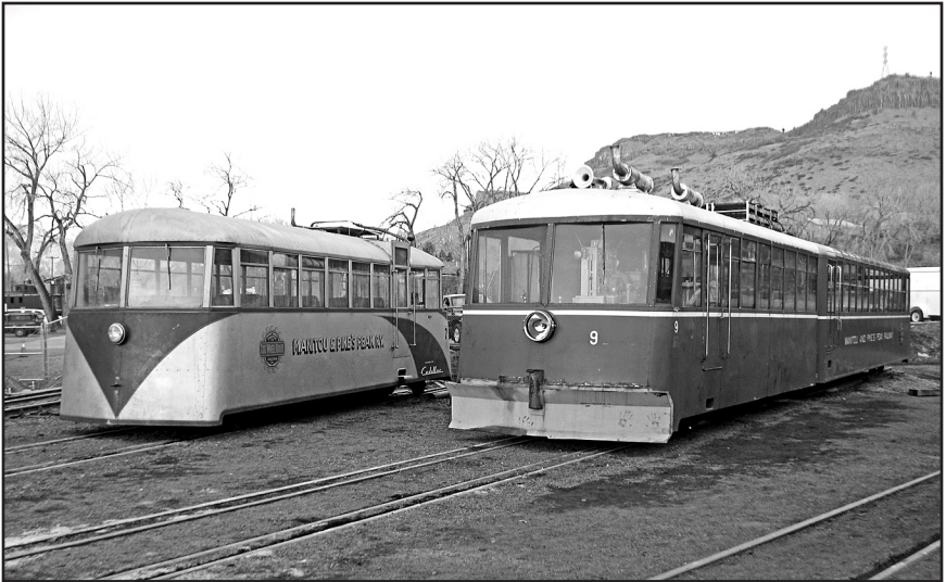
The Manitou & Pike's Peak Railway gasoline car #7 (left) and diesel motor #9 with coach #12 are on the rails at the Colorado Railroad Museum.